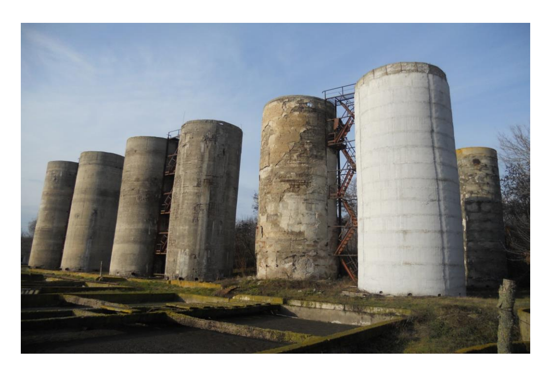
Fig. 3. Tower biofilters of the wastewater treatment plant of Khorol factory for baby food

Chemical analysis of wastewater samples before and after the tower biofilters allows to determine the efficiency of the tower biofilters work. The results are presented in Table 3.