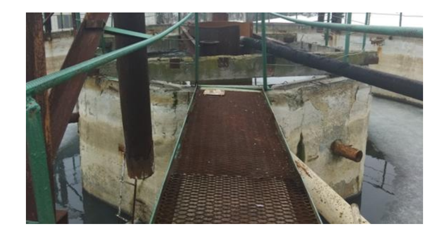
Fig. 2. Clarifier-digester at the wastewater treatment plant of Khorol factory for baby food

At the WWT plant of the Khorol factory for baby food, the clarifiers-digesters are installed in accordance with the typical project 902-2-315 with the size of the facilities d=12m, h=9,48m and the size of the clarifiers d=5 m and h=7,75m, the technological volume of digester – 540 m<sup>3</sup>. At the treatment facilities, two nodes of the clarifiers-digesters with the number of units 4 and 2 are installed. The clarifier and digester are separated from each other to avoid the possibility of digested sludge falling into a zone of clarifying and ensures a reduction of concentrations of suspended substances in wastewaters by 70% and BOD<sub>T</sub> by 15%.